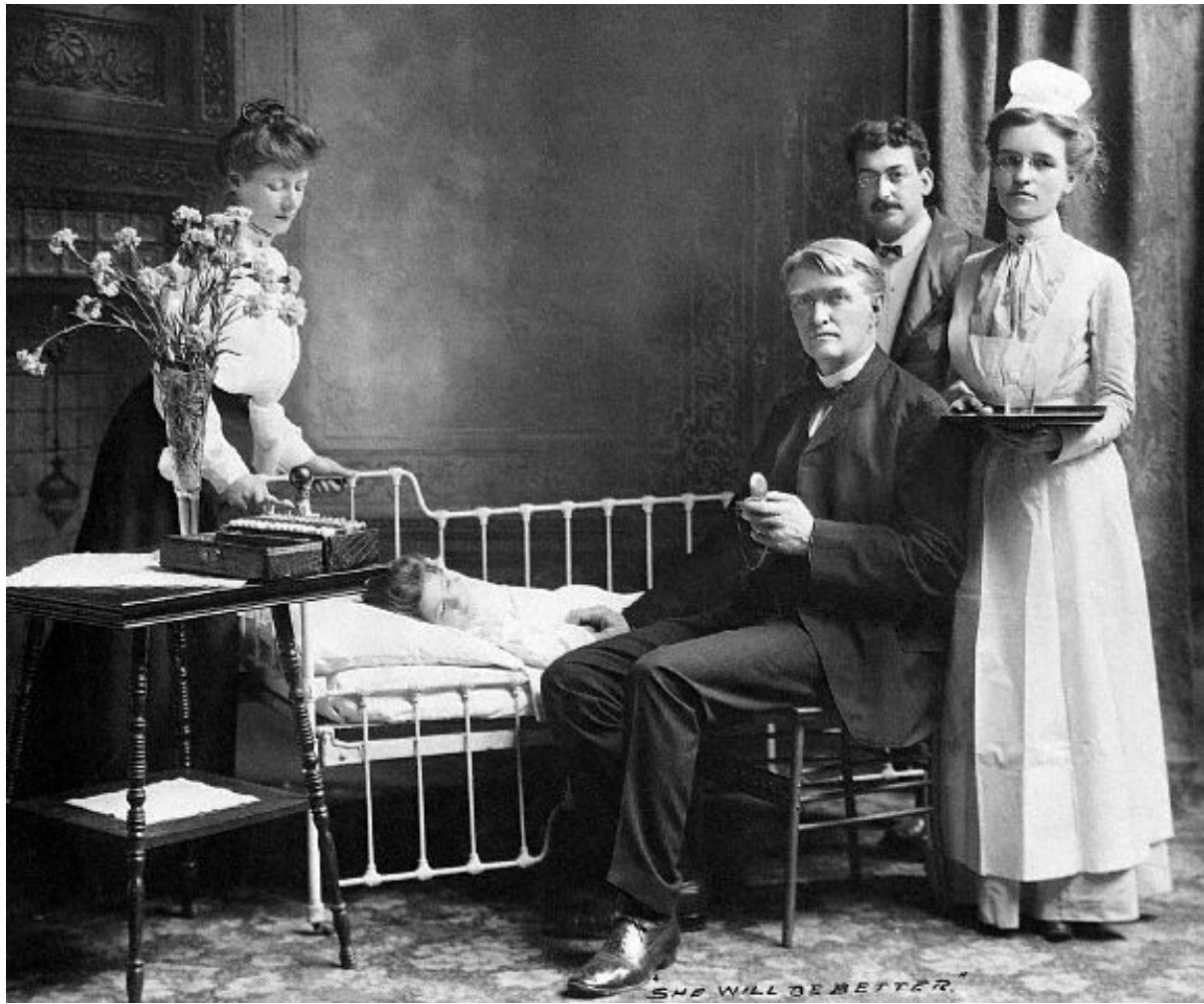
Doctor and Nurse Attending to Child 1900