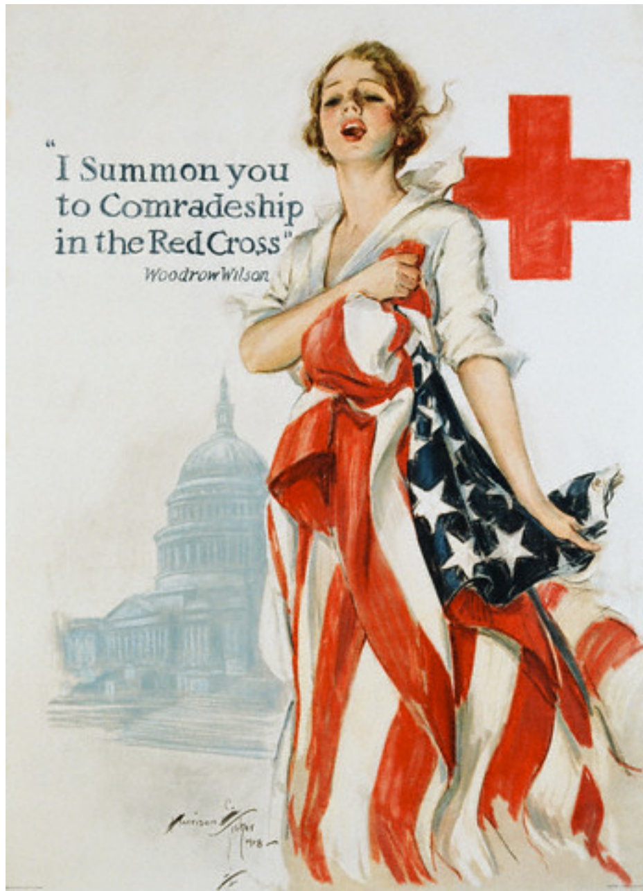
I Summon You to Comradeship in the Red Cross Poster by Harrison Fisher 1918