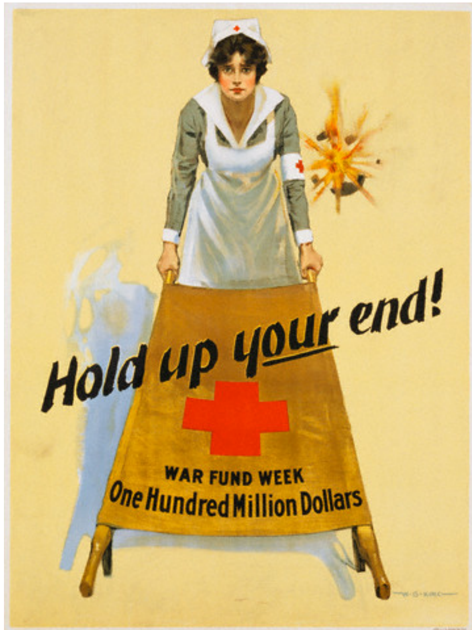
Hold Up Your End! War Fund Week - One Hundred Million Dollars Poster by W.B. King 1918