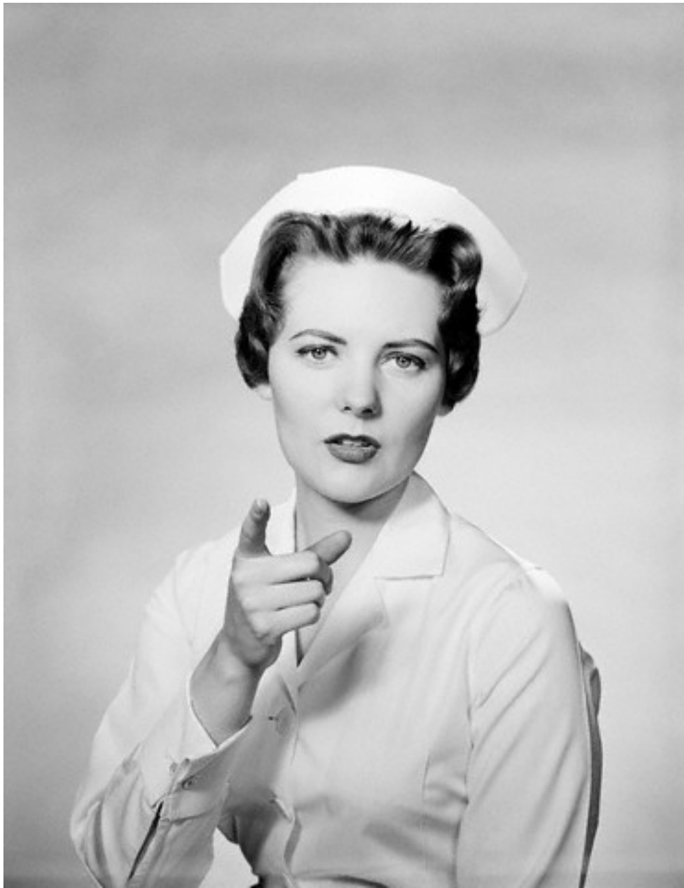
BEHAVIOURIST BATTLE AX IMAGE