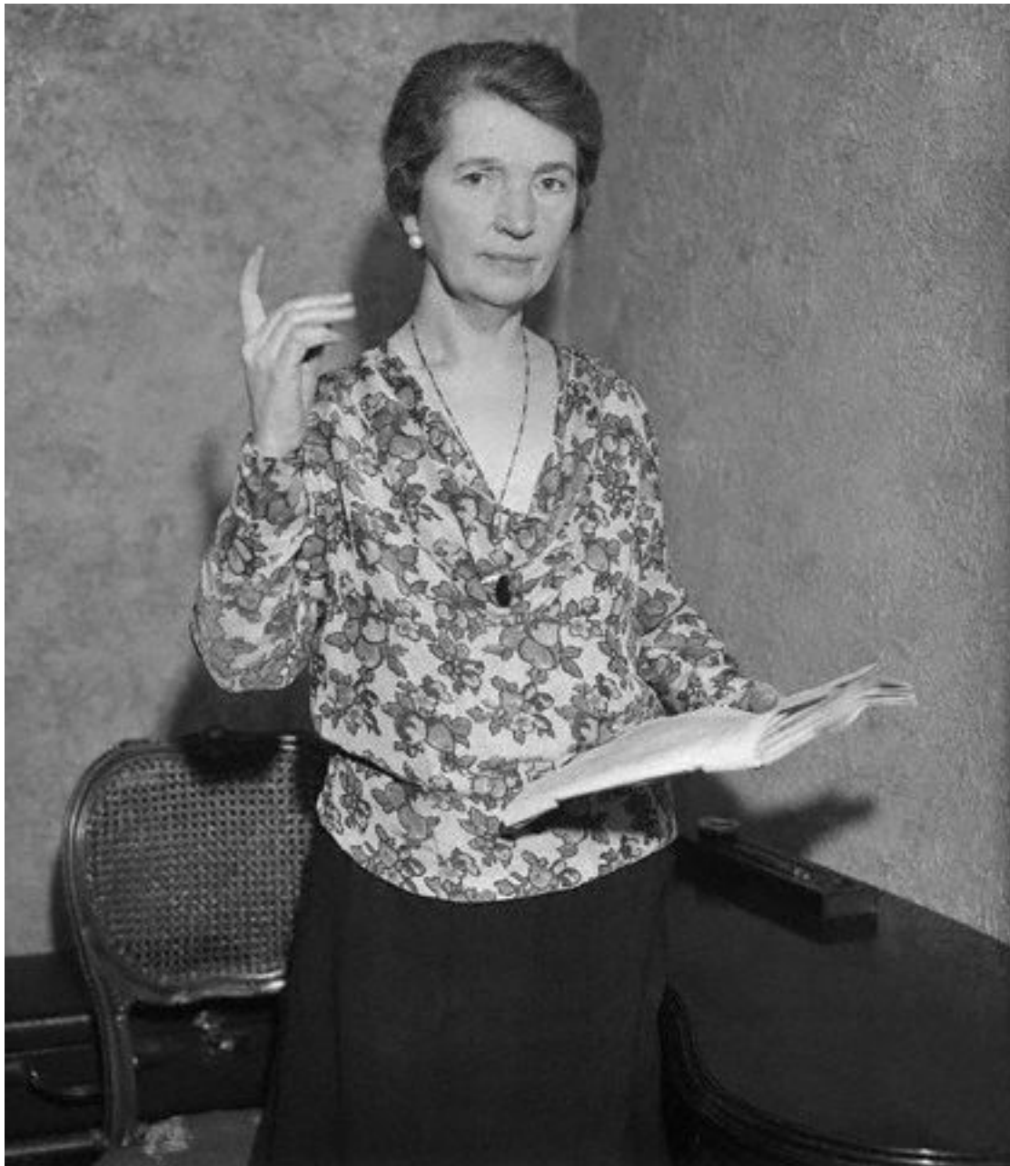
Margaret Sanger Preparing for Senate Speech Original caption: 2/11/1931- Margaret Sanger, birth control advocate (above) will soon appear before the Senate Judiciary committee in Washington, D.C., seeking support of the "Doctor's Bill", introduced by Senator Gillet of Massachusetts.