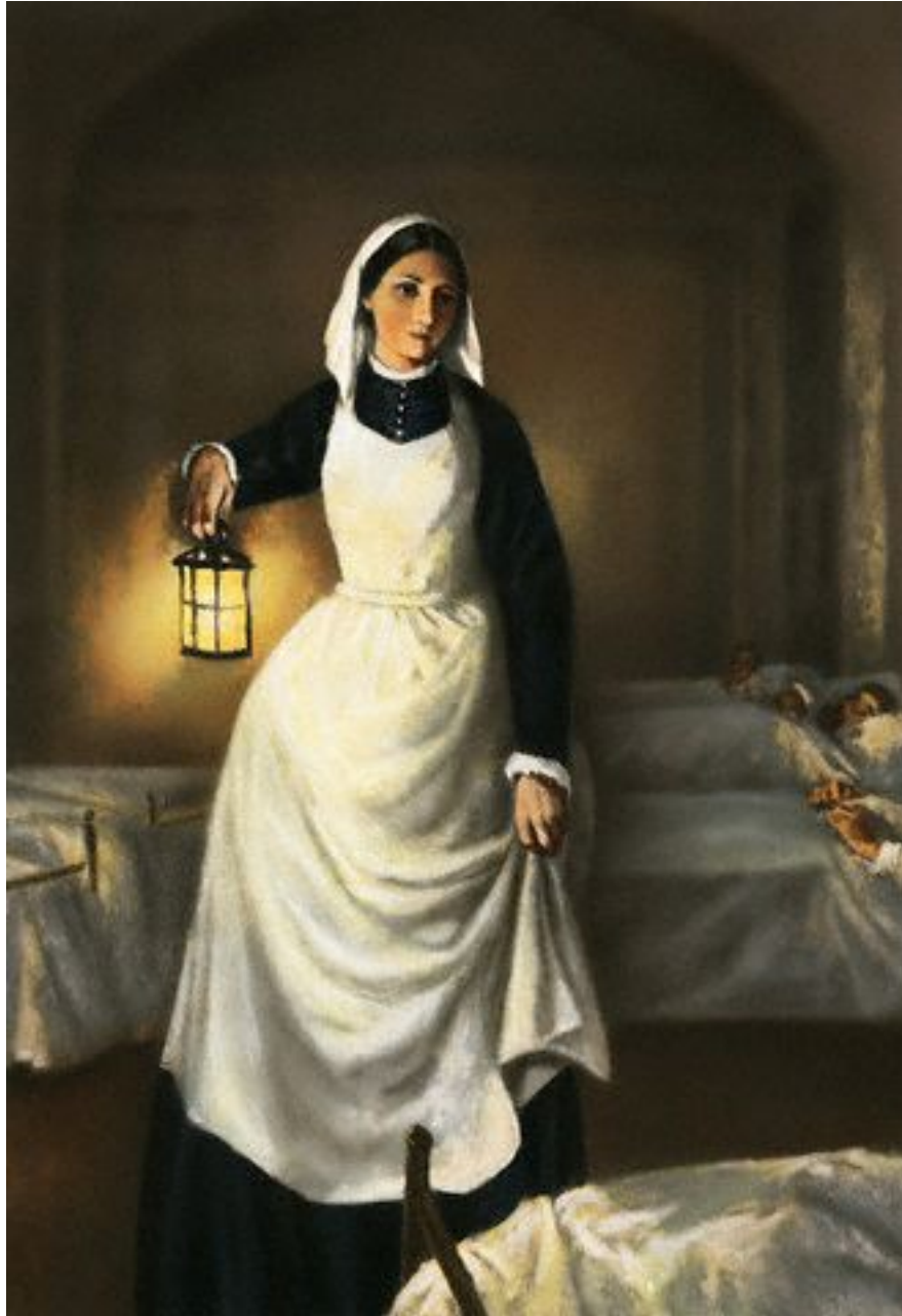
Illustration of Florence Nightingale Holding Lamp

Original caption: Lady with the lamp- Florence Nightingale (1820-1910).