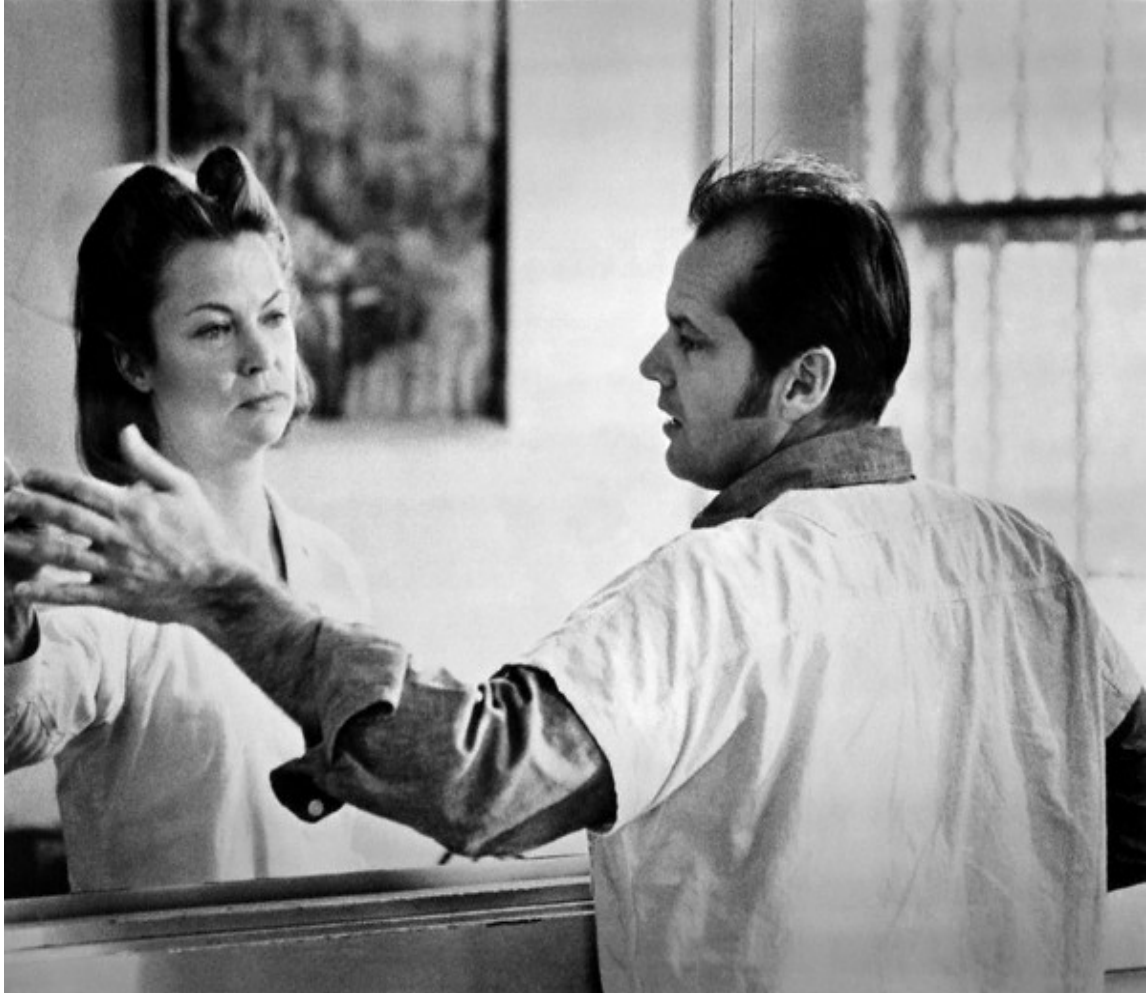
Jack Nicholson in One Flew Over the Cuckoo's Nest Jack Nicholson and Louise Fletcher in a scene from the movie One Flew Over the Cuckoo's Nest .