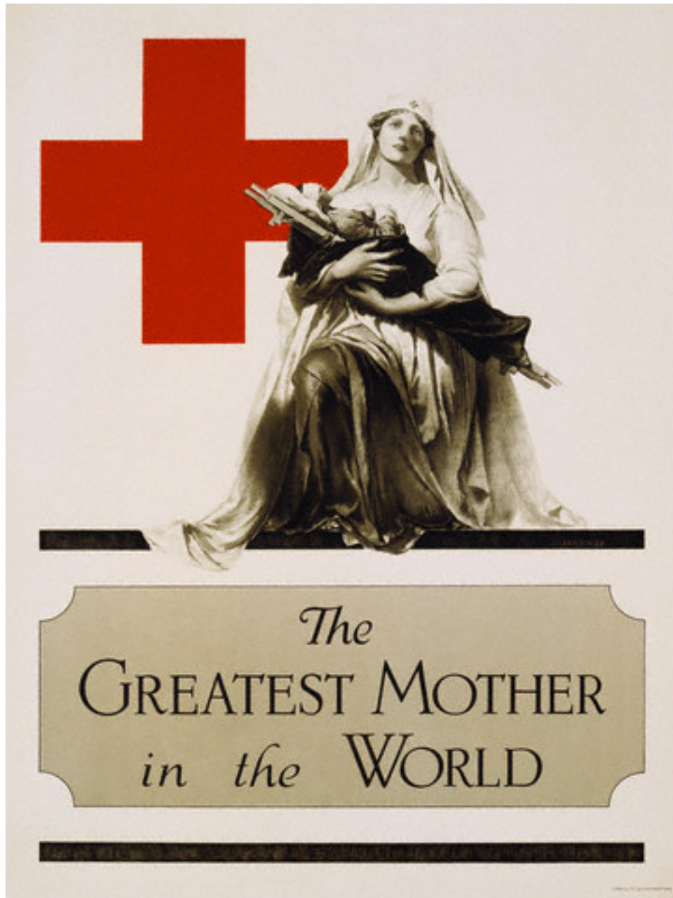
The Greatest Mother in the World Poster by A.E. Foringer 1918