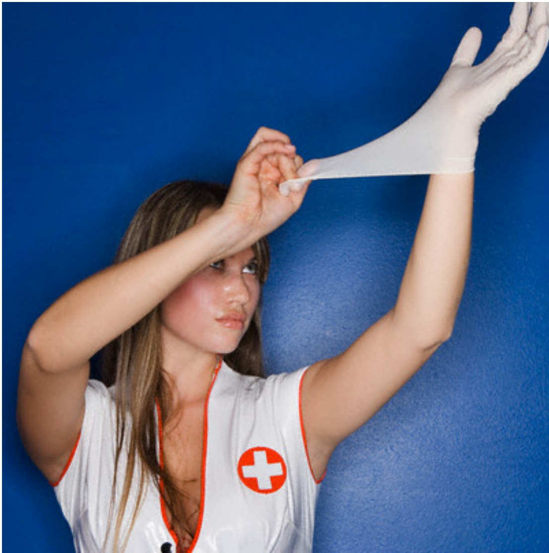
SEX OBJECT IMAGE