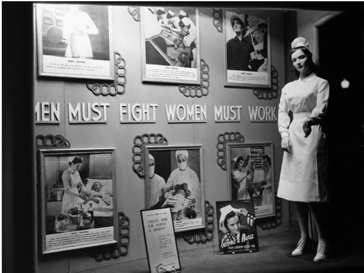
War Information Posters Posters distributed by the US Office of War Information displayed at Lansburgh's Department store. The posters call for women to enroll as student nurses of the Army and Navy. Washington, DC, May 1943