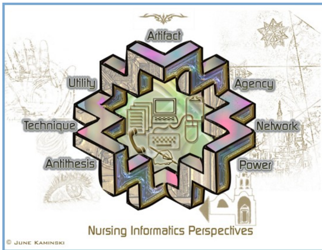
Figure 1: Nursing Informatics Perspectives Reflected in the Literature

significant perspectives of informatics identified from the literature include: Antithesis, Artifact, Utility, Technique, Agency, Networks, and Power (see Figure 1). All seven of these perspectives present an unique lens to consider when analyzing nursing informatics within (or outside) the context of nursing education culture.