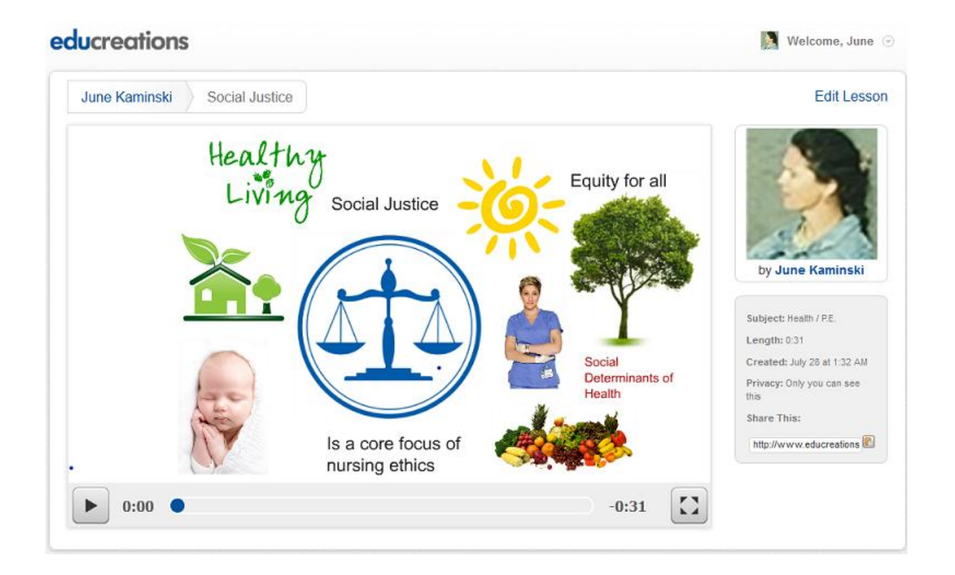
Figure 1: Screenshot of Educreations Website Account Viewing Screen