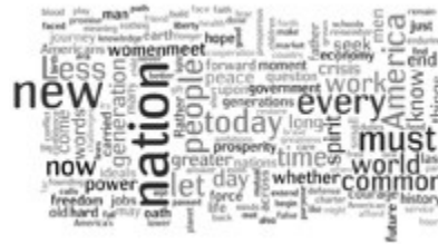
Click image for larger view

An example of using tag clouds to highlight text documents, is the tag cloud formed by words in President Obama's recent inauguration speech, available on Flickr.