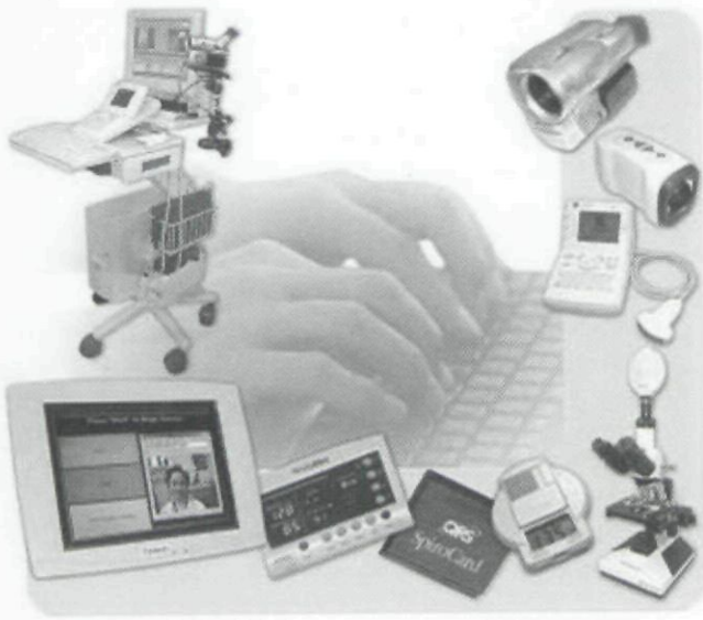
FIGURE 1. Mobile applications in healthcare.

personal digital assistants (PDAs), or tablet personal computers (PCs) that enable electronic data collection or reporting at point of care: hospital bedside, outpatient clinic, or patient's home (Fig 1). Despite the digital divide slowly narrowing in the older population, the use of e-health applications by nurses has enormous potential to enable elderly persons with chronic conditions to improve self-management skills, 5,6 symptom and intervention management, and quality of life when point of care becomes the patient's home. 7 As vendors develop mobile and user-friendly applications and Internet providers make services more affordable, the potential to apply e-health care, from Web-based health information to full primary care services in the patient's home, becomes less a fantasy and more a reality.